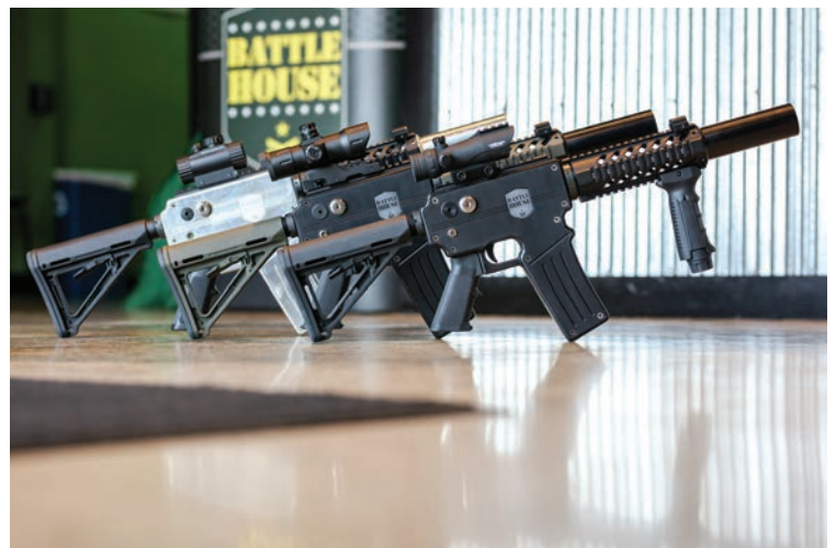
The XM4 Modeled after the military's workhorse, the M-4

Do away with all that personal hygiene concern for sanitation and look out for your customer's health and wellness with our simple headset solution.